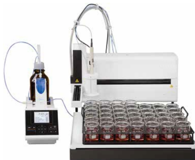
Titramax VT with connected autosampler for 42 samples