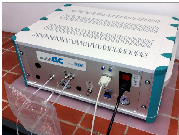
MobilGC with connected gas sampling bag